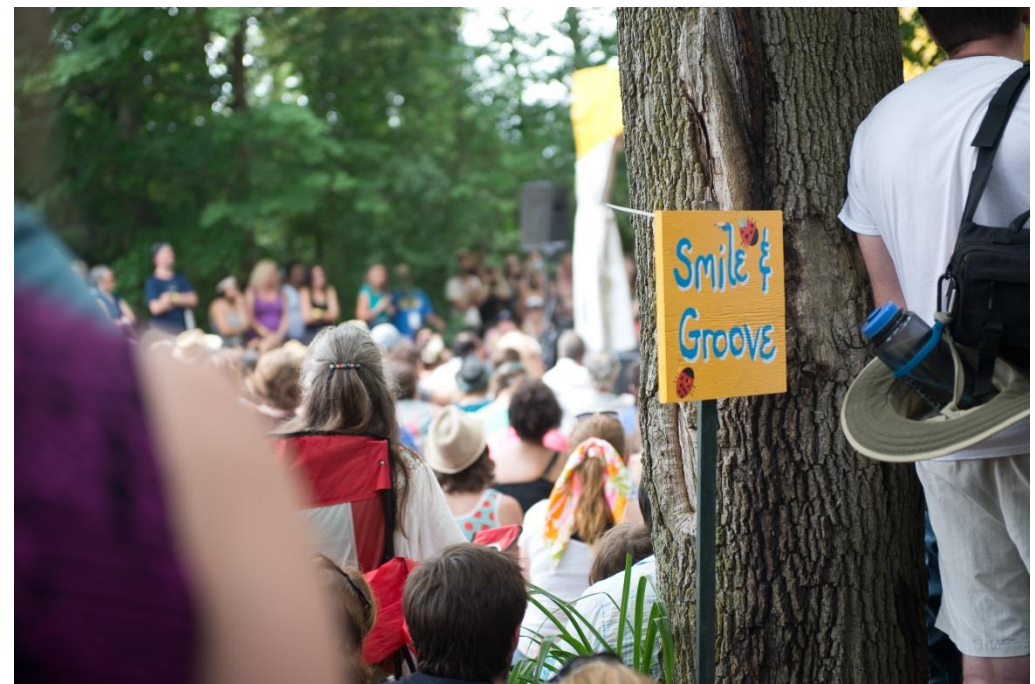
• Teigan Baker photographer